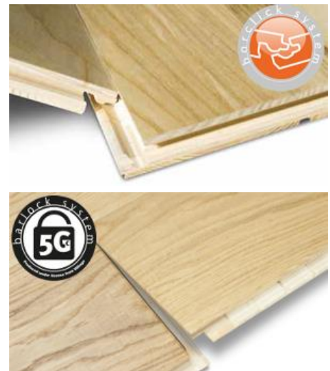
Fig. 2. Views of Barlinek floorboards with 5Gc BARLOCK and BARCLIK systems