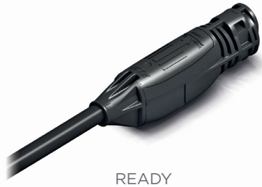
READY (fully closed)

Note: for detailed instructions, check Application Specification 114-133104