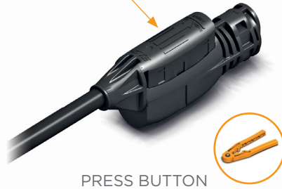
PRESS BUTTON (terminate cable)