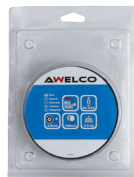
FLUX Ø0,9mm 0,5kg Cod. 92960 FLUX Ø0,9mm 1,0kg Cod. 92967