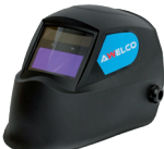
HELMET 2000 E 11 COD. 90385