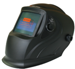
HELMET 1500-G COD. 90356