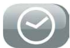
Timer (9 hours)