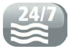
Permanent water drainage tube