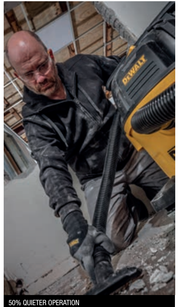
50% QUIETER OPERATION