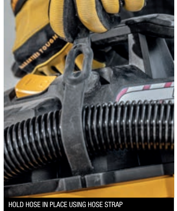
HOLD HOSE IN PLACE USING HOSE STRAP