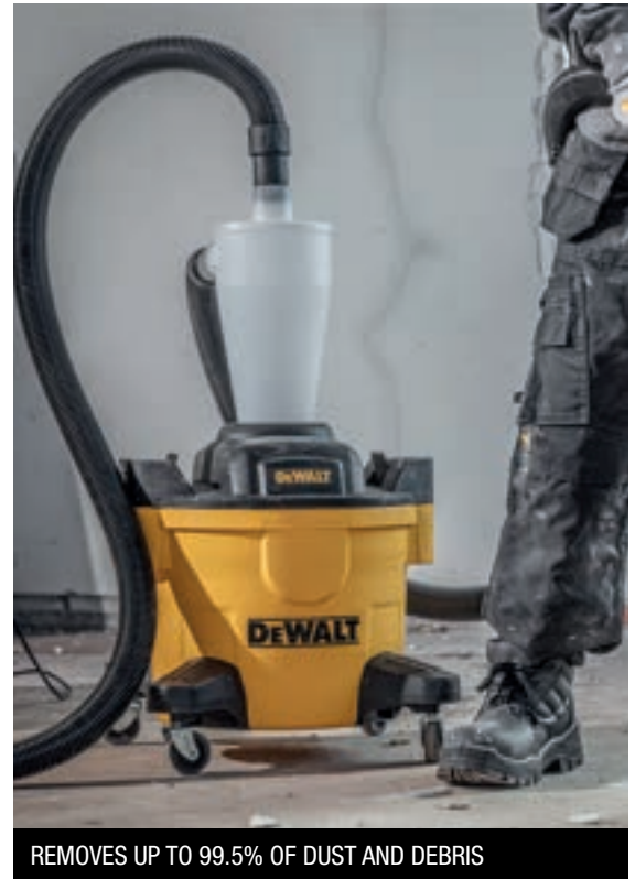
REMOVES UP TO 99.5% OF DUST AND DEBRIS