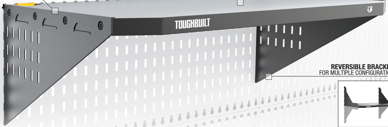
REVERSIBLE BRACKETS FOR MULTIPLE CONFIGURATIONS