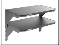
OVERLAP BRACKETS FOR CLOSER SHELF SPACING

DELIVERS PROFESSIONAL-GRADE STORAGE WITH UNMATCHED VERSATILITY