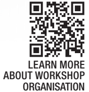
LEARN MORE ABOUT WORKSHOP ORGANISATION