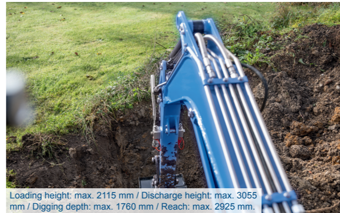
Loading height: max. 2115 mm / Discharge height: max. 3055 mm / Digging depth: max. 1760 mm / Reach: max. 2925 mm.