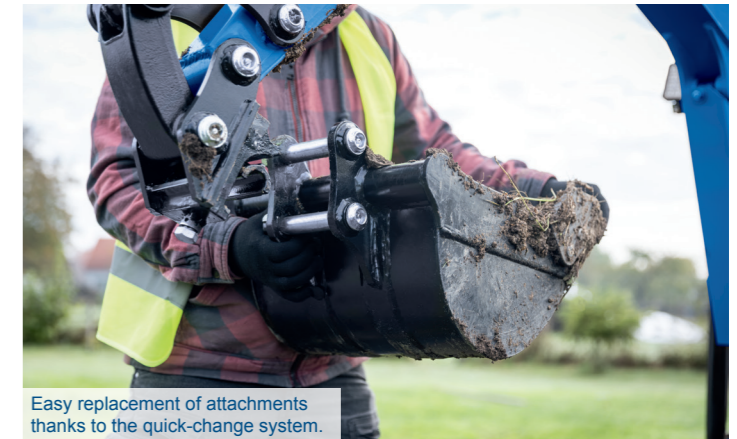
Easy replacement of attachments thanks to the quick-change system.