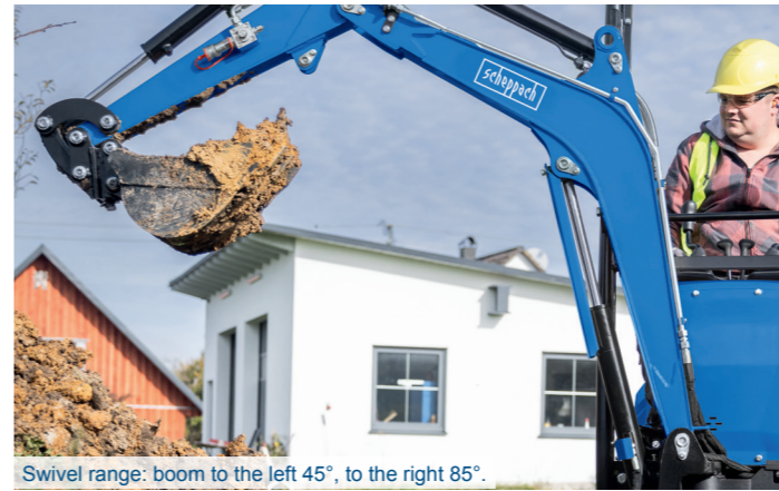
Swivel range: boom to the left 45°, to the right 85°.