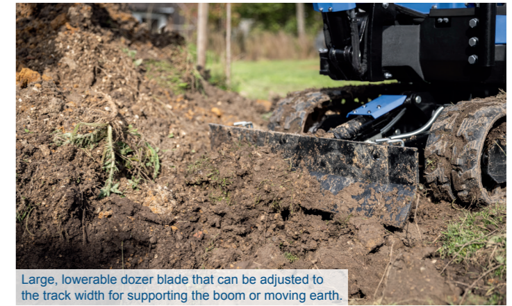
Large, lowerable dozer blade that can be adjusted to the track width for supporting the boom or moving earth.