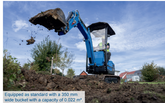
Equipped as standard with a 350 mm wide bucket with a capacity of 0.022 m 3 .