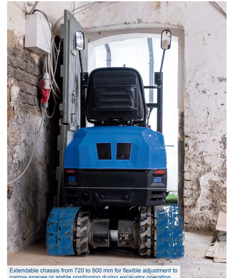
Extendable chassis from 720 to 900 mm for flexible adjustment to narrow spaces or stable positioning during excavator operation.