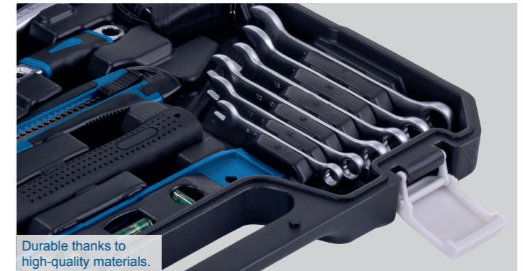
Durable thanks to high-quality materials.