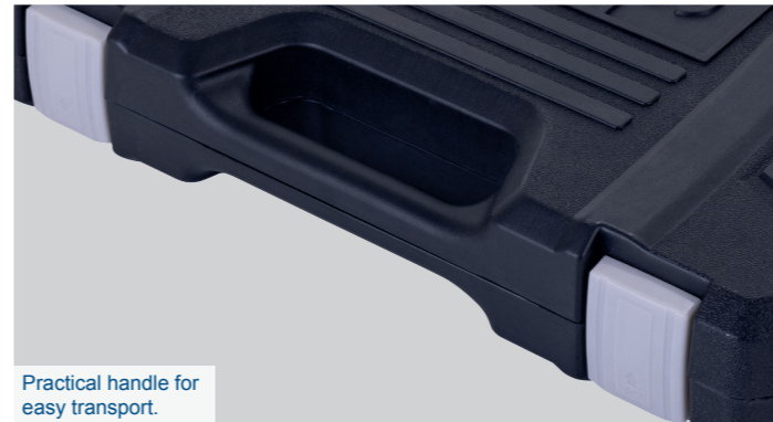
Practical handle for easy transport.