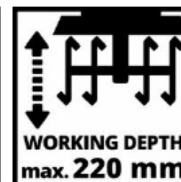
WORKING DEPTH max. 220 mm