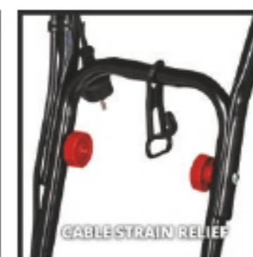
CABLE STRAIN RELIEF