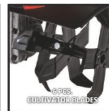
6PCS CULTIVATOR BLADES