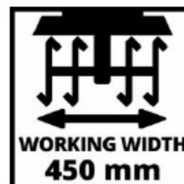
WORKING WIDTH 450 mm