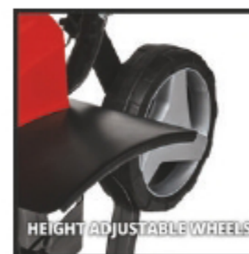
HEIGHT ADJUSTABLE WHEELS