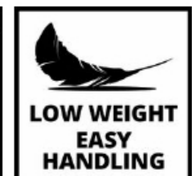
LOW WEIGHT EASY HANDLING