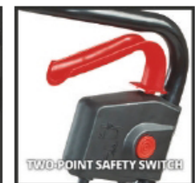
TWO-POINT SAFETY SWITCH